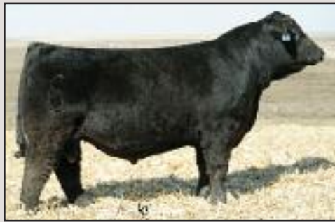
CCR Cowboy Cut