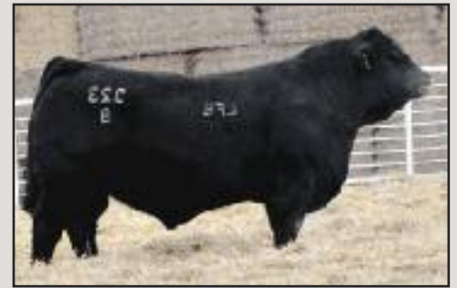
LFE The Riddler