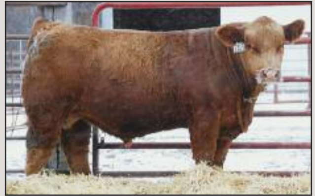
TRAXS Deadwood – Sire of Lot 38

Here is a pound maker here! 932E ranks in the top 10% for WW EPD's, top 3% for YW EPD's, and top 15% for MWW EPD's in the breed, ratioed 102 for YW. Solid red non diluter, hetro polled. Scrotal 41 cm. Frame Score 6.7.