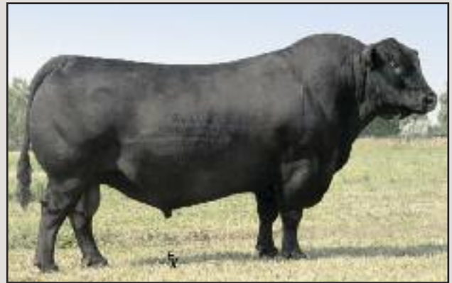
S A V Final Answer – Sire of Lots 28 & 29

This own son of Final Answer should do the trick for making nice females, he ranks in the top 15% for MM and MWW in the breed. He is out of a first calf heifer to boot. Homo Polled, Hetro Black Scrotal 37.5 cm. Frame Score 6.1.