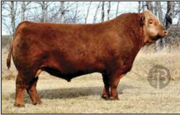
Kuntz Sheriff – Sire of Lot 1