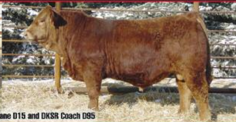
New Herd Sires BBS Hurricane D15 and DKSR Coach D95